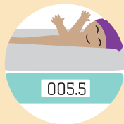
Feeding & Growth

Your baby will benefit from the clinic team's expertise and care in areas of: