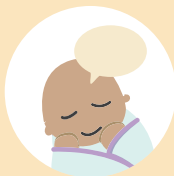
Language & Communication