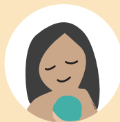
Caregivers' Mental Health