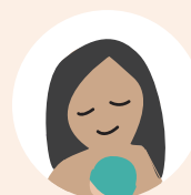
Caregivers' Mental Health