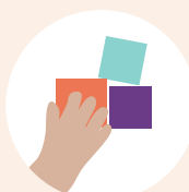
Thinking & Problem Solving