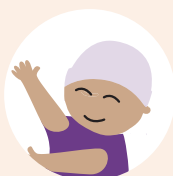
Motor Skills (Muscles)