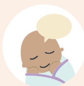
Language & Communication